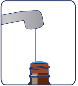
Turn the water to a low flow and fill both bottles completely, leaving a slight meniscus of water above the top lip.